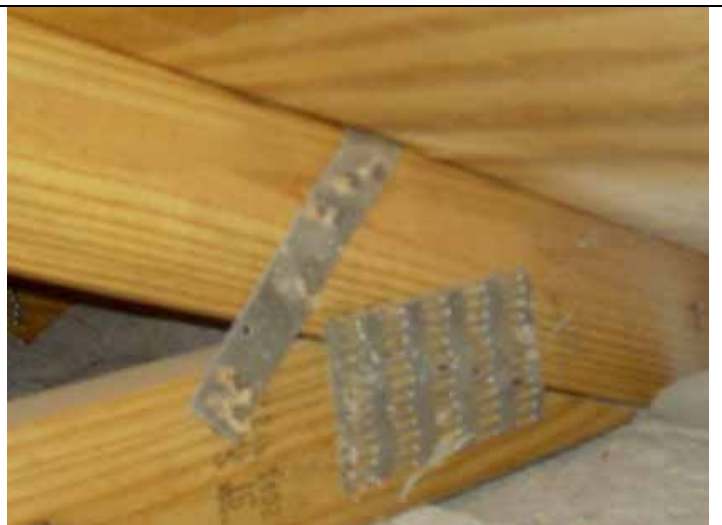
Roof to wall attachment