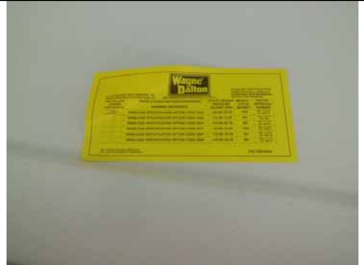
Garage door data