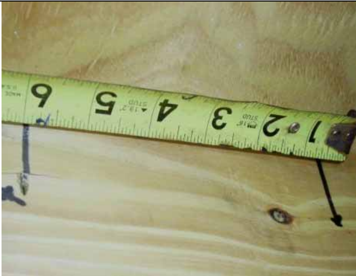
Roof deck attachment