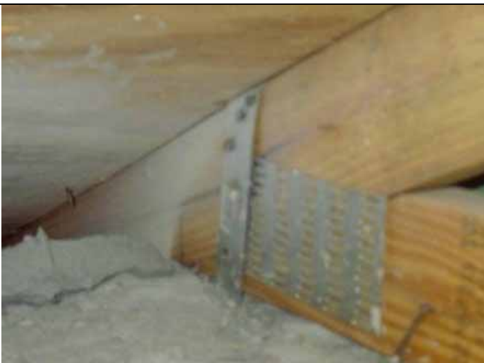
Roof to wall attachment