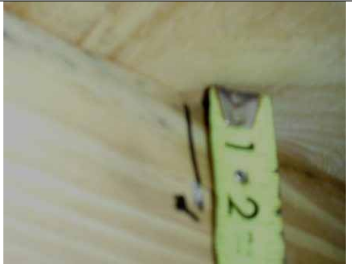
Roof deck attachment